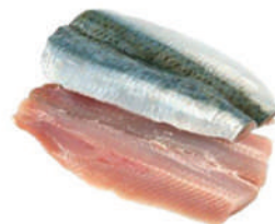
Filet de sardine